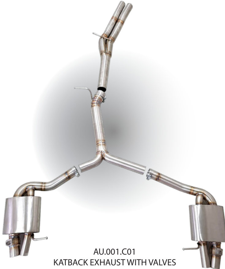
AU.001.C01 KATBACK EXHAUST WITH VALVES

For more information: marketing.tflitaly@gmail.com +39 3283348810