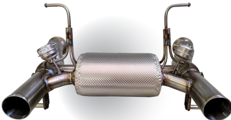
LA.004.C01 REAR MUFFLER WITH VALVES

For more information: marketing.tflitaly@gmail.com +39 3283348810