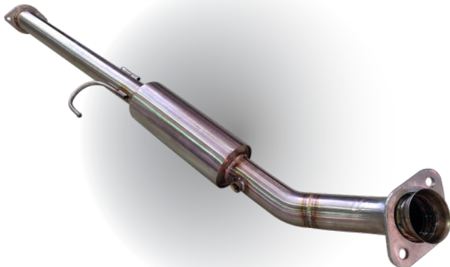
TO.001.C01 CENTRAL SECTION